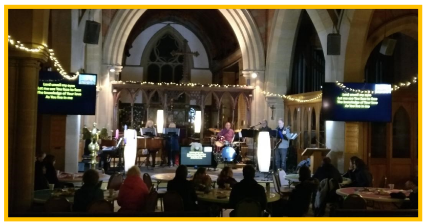
Page 4 New services: Intergenerational worship