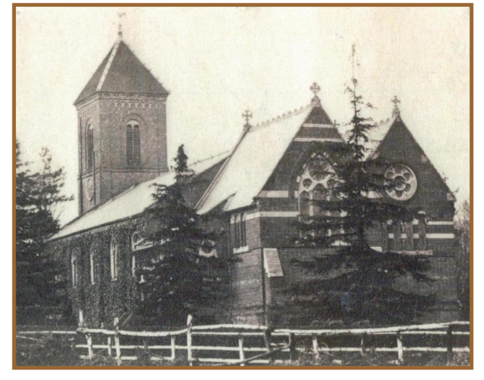
Page 6 Living History: Our church as it looked before 1887