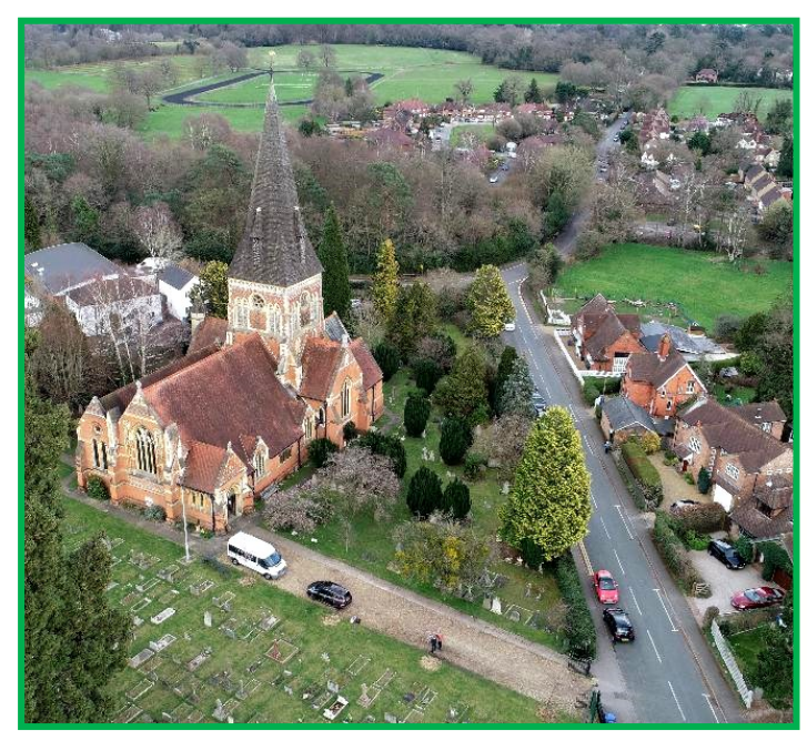
Page 8 Expansion of the Church's Foodbank provision

Holy Trinity Sunningdale Church and Community Sharing God's Love To live by faith, to be known by love, to be a light of hope